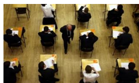
Post Qualification Admissions