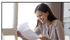
Aspirational Applications Rise